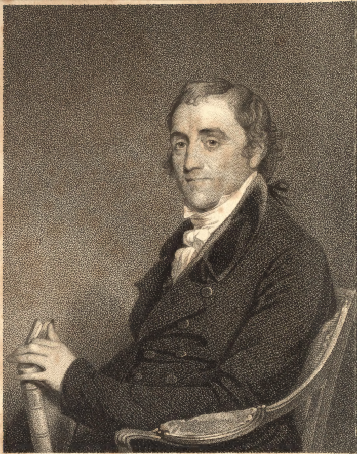
G. Stuart Pinx: